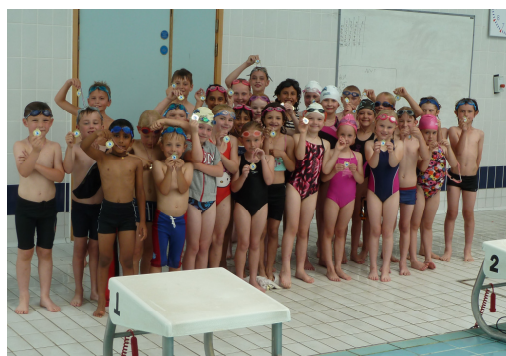
Yellow, Green & Sky swimmers show off their medals

10 th July saw around 150 Bluefins members at the Aquadrome for our Sprint Championships. With the top tier of the club taking part in competition elsewhere, it was a great opportunity for others to show what they can do. In particular, some 40 of our Lessons Programme swimmers raced, many for the first time.